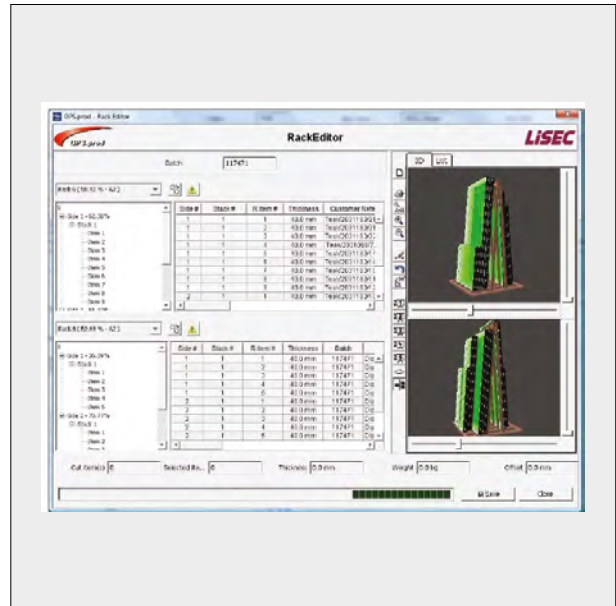
Three-dimensional rack optimisation

It all adds up to big savings for our customers