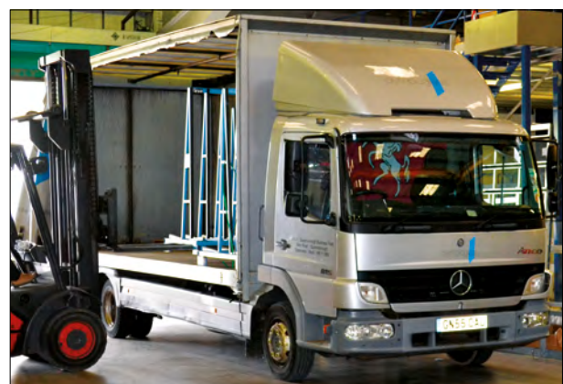
All deliveries are on real-time vehicle tracking